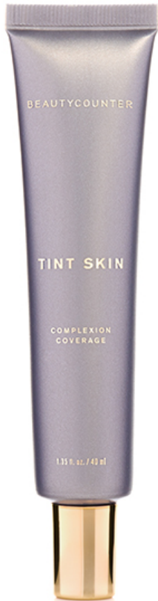
TINT SKIN COMPLEXION COVERAGE $38.00