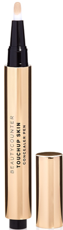
TOUCHUP SKIN CONCEALER PEN $28.00